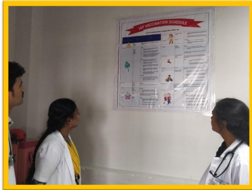
CRRI is been taught about Immunization Schedule

Ph.no: 044-27598484/27565195; Fax: 044-27565170; E-mail: kims.medical@yahoo.com ; Website: www.kveg.in