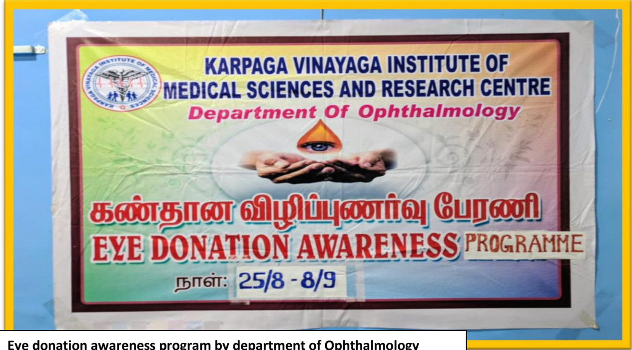
Eye donation awareness program by department of Ophthalmology

Ph.no: 044-27598484/27565195; Fax: 044-27565170; E-mail: kims.medical@yahoo.com ; Website: www.kveg.in