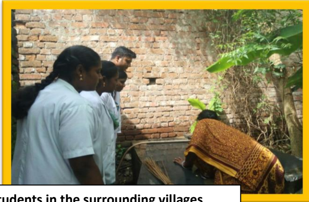
Dengue awareness program by our medical students in the surrounding villages