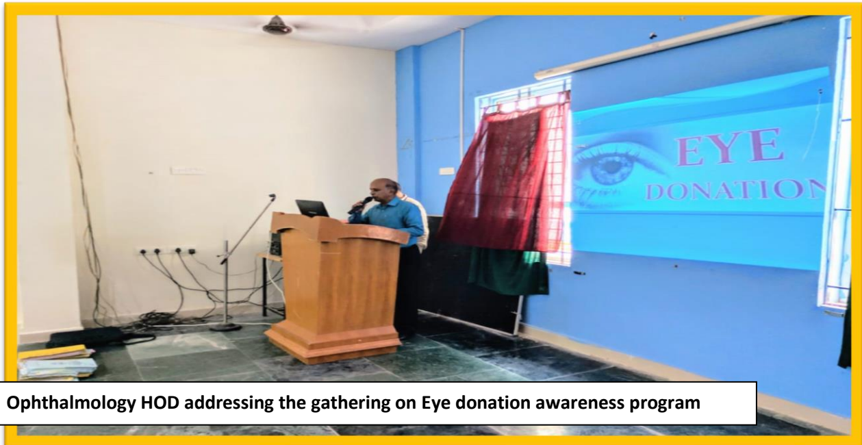
Ophthalmology HOD addressing the gathering on Eye donation awareness program