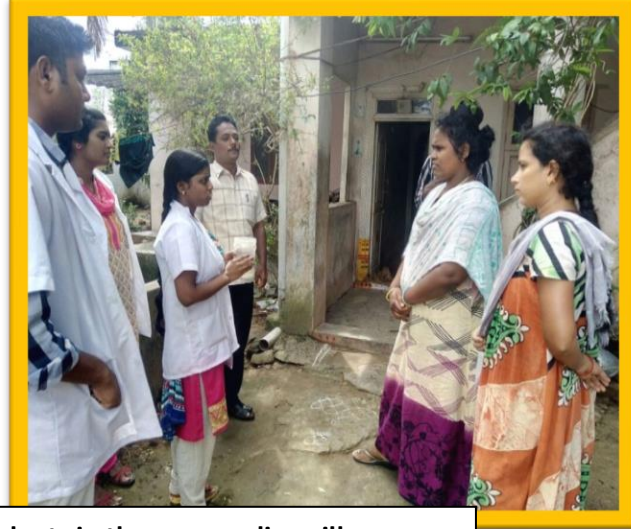
Dengue awareness program by our medical students in the surrounding villages