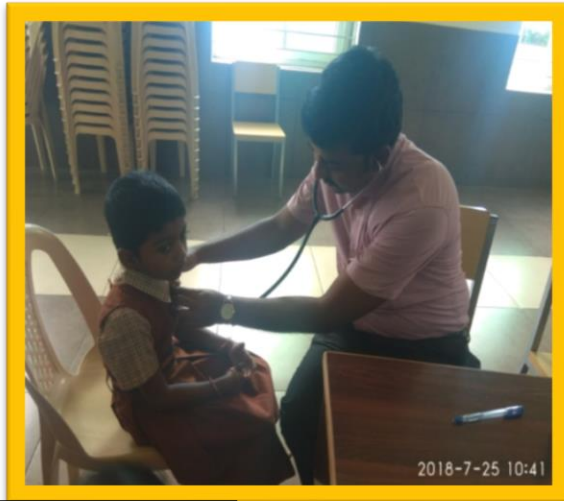
Our doctors doing medical check up to the school children