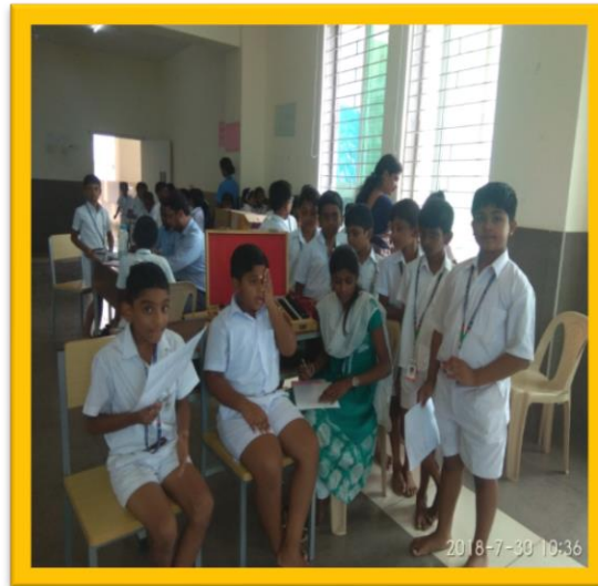
Health check-up, blood group screening program by Karpaga Vinayaga Institute of Medical Sciences and Research Centre to school children