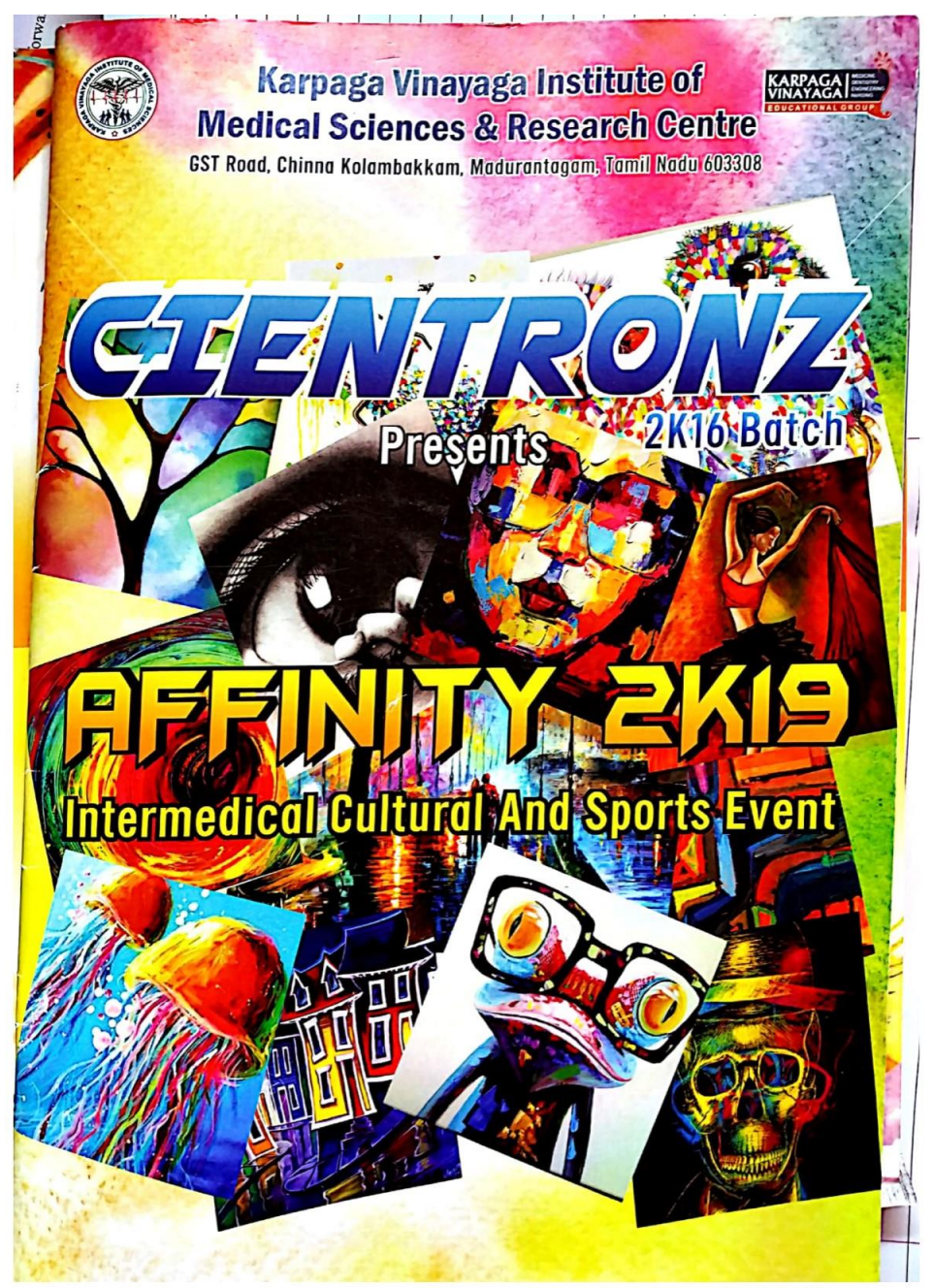
Scanned by CamScanner

Ph.no: 044-27598484/27565195; Fax: 044-27565170; E-mail:kims.medical@yahoo.com; Website: www.kveg.in/